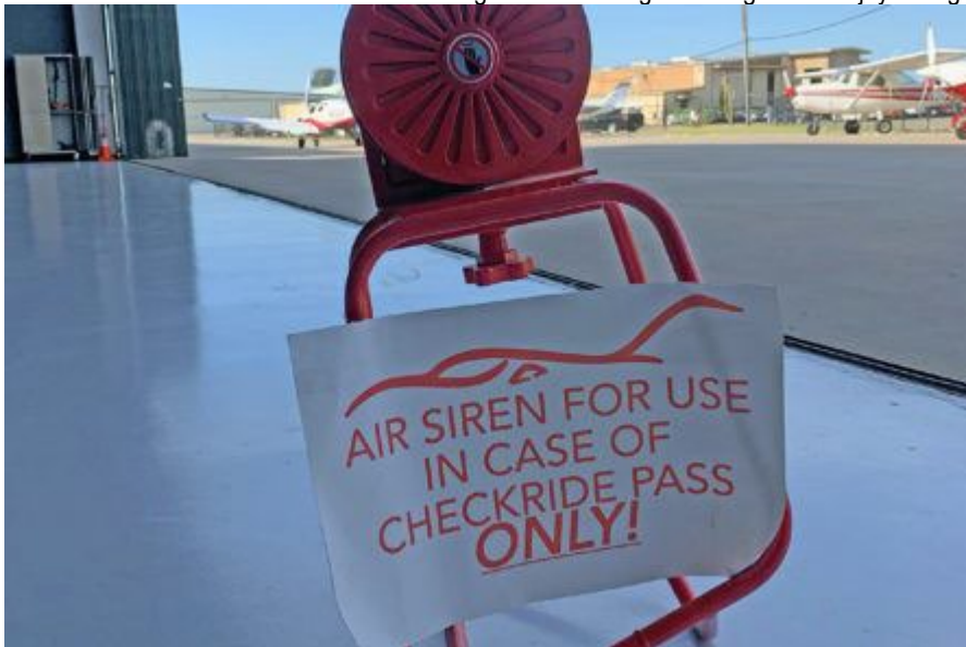
The Checkride Siren

It's a common occurrence for us to throw burgers and hot dogs on the grill and enjoy time getting to know each other.